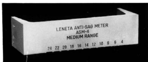
FIG. 2 Medium Range Anti-Sag Meter

vertically with the drawdown stripes horizontal, similar to rungs of a ladder, with the thinnest stripe at the top. After drying in this position, the drawdown is examined and rated for sagging. A typical sag pattern obtained by this procedure is shown in Fig. 3.